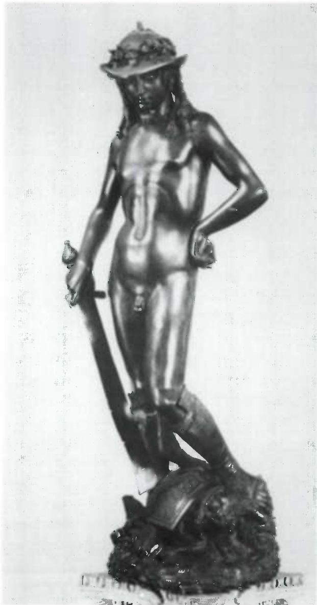
FLORENCE. Bargello. Donatello, David.

Each of these collections is arranged alphabetically by province and within each province alphabetically by place. Within each place (city or village), the arrangement is alphabetical by location (churches, museums, etc.), and further subdivisions are made where necessary.