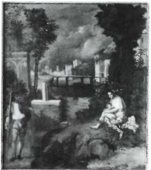
VENICE. Calleria dell'Accademia di Belle Arti. Giorgione, The Tempest.