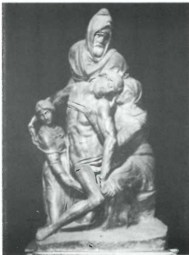
FLORENCE. Cathedral. Michelangelo, Pietà.

Prepaid orders are sent postpaid. If not prepaid, a 5% charge is added for postage, insurance, and handling costs (minimum charge Sfr 10).