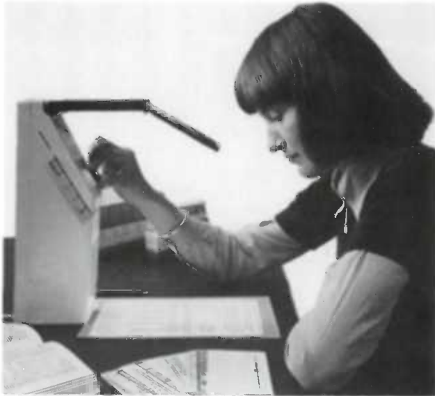
Fuji RFP 2 microfiche reader