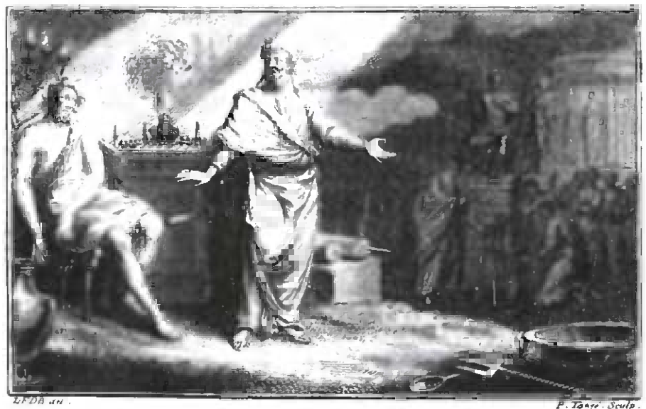
Illustration from: Novum Testamentum Graecum / Joannis Jacobi Weistnenii . Amstelaedami, 1751-1752.