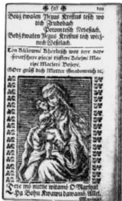
Canisius, Petrus, Saint. Tón mawó kžescziyanski khatolski Khatechismus... Knéza 1735.