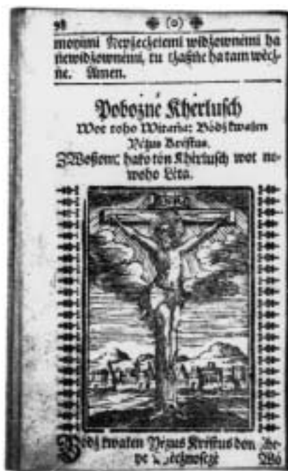
Canisius, Petrus, Saint. Tón mawó kžescziyanski khatolski Khatechismus... Knéza 1735.

Cover illustration from: Canisius, Petrus, Saint. Tón mawó kžescziyanski khatolski Khatechismus... Knéza 1735.