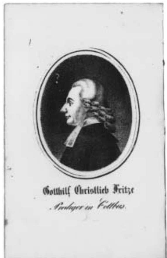
Fritz, Gotthilf Christlieb . Bátowarske kńigli : wo kotarichž sse namakaju... Grodku, 1842.