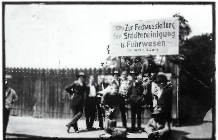
Photo of Theo and Nelly van Doesburg with a.o. Werner Gräff, Raoul Hausmann, Hans Richter and El Lissitzky. (Archive inventory chapter 13B)

Photo portrait of Theo van Doesburg by Lucia Moholy Nagy, (1922?). (Archive inventory chapter 13A)