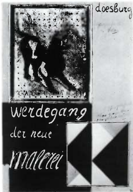
Theo van Doesburg's manuscript Werdegang der neuen Malerei . (Archive inventory no. 396)

Architecture; Fine art; Dada; Decorative art; Literature; Music; The Russian revolution; Miscellaneous themes.