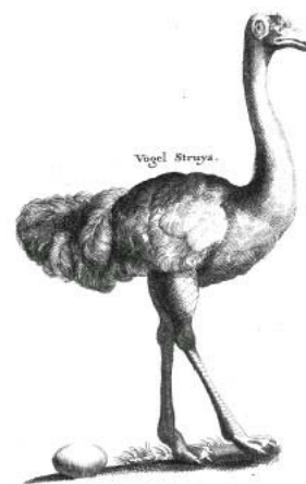
Kolb, Peter. Naaukeurige en uitvoerige beschryving van de kaap de Goede Hoop ...Amsterdam, 1727.