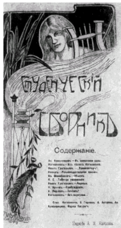
Studencheskiĭ sbornik Kazanskikh studentov. Izdanĭe A.I. Kolosova. Simbirsk, 1907.

Studencheskiĭ sbornik Kazanskikh studentov / Izdanĭe A.I. Kolosova. Simbirsk : Tip. A.I. Kolosova, 1907. 173 p. 4 microfiches. Order no. RSP-63